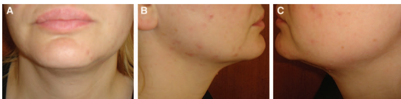
Fig. 7. Postoperative (1 year) pictures—case 2. Observe the remarkable improvement of the jowls: front view (A), lateral right view (B), and lateral left view (C).