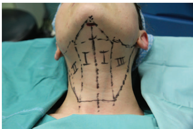
Fig. 2. Preoperative neck area design for treatment.

The RFAL delivers radiofrequency converted into heat, estimated in kilojoules. The mean amount of energy delivered was 4.5 kJ per procedure (2–8.5 kJ).