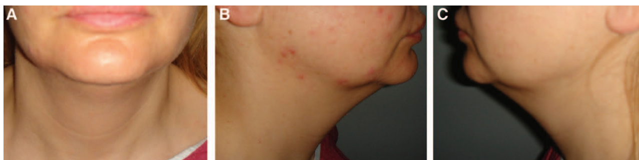
Fig. 6. Preoperative pictures—case 2: front view (A), lateral right view (B), and lateral left view (C).