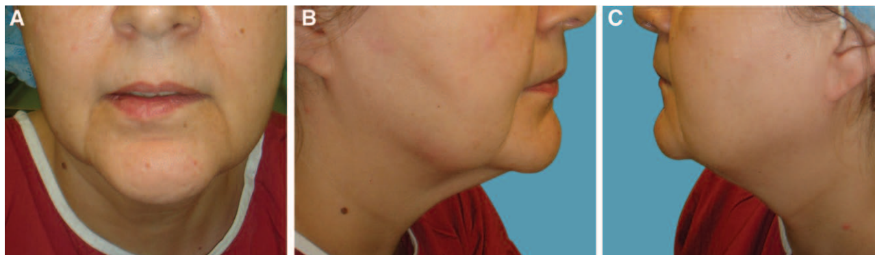
Fig. 3. Preoperative pictures—case 1: front view (A), lateral right view (B), and lateral left view (C).